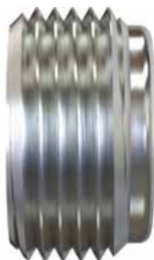
Solid Alloy Steel Hazardous Locations Reducing Bushings