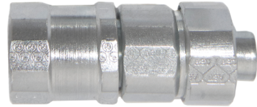
Greenfield to Liquid Tight

Superior Performance for Secure Connection and Fast Disconnect No Tools Required to Install Conduit