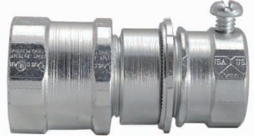
Greenfield to EMT Set Screw