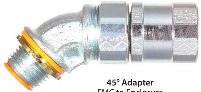
45° Adapter FMC to Enclosure Made in the USA