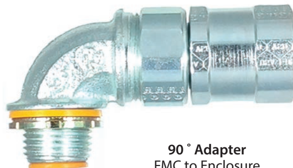
90° Adapter FMC to Enclosure Made in the USA