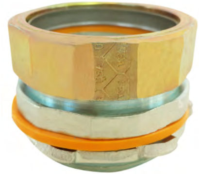
Featuring: EZ-Torque Compression Nut

AMFICO distinctive design features a unique zinc gold plated compression nut. This enables inspectors to visually inspect rain tight conformance from a distance. Rain tight close-up inspection is no longer required when you use the AMFICO Gold Standard.