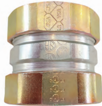
Featuring: EZ-Torque Compression Nut

Easily identify Rain Tight Connections with our Gold Zinc Plated Compression Nuts